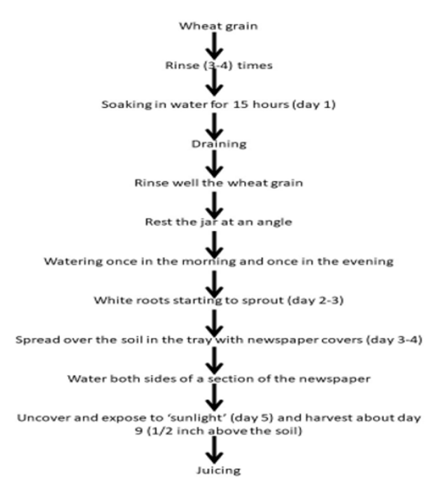
Figure 1: Flow diagram of wheatgrass growing and extracting (Abe Tullo, 2022)