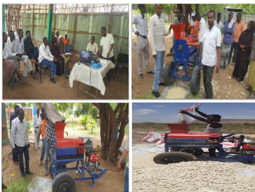
Figure 2: Theoretical and practical training of the engine-driven maize sheller machine