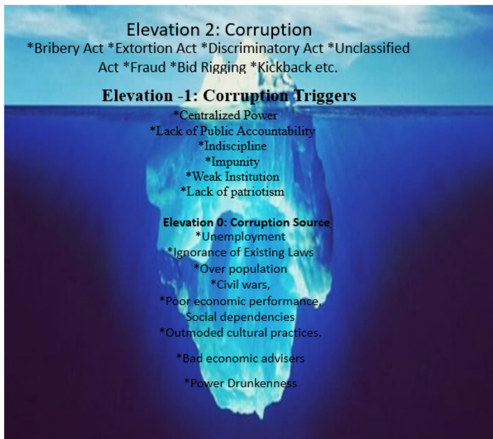
Figure 3: Iceberg Model for Corruption Practices, triggers and Sources

Braimah, (2016) argues strongly that bribery have the tendency to influence many judgments in favor of individuals or group of people who are ready to engage in paying bribe in detriment of the poor and vulnerable in society Figure 03 below provides detail information about the corruption practice, the triggers and sources.