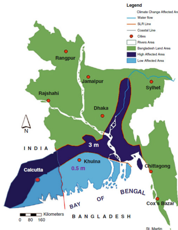
Figure 1: Climate change impacts in the coastal region of Bangladesh.

The negative consequences of climate change and environmental degradation are forcing an increasing number of people to relocate or put themselves in danger in the southwest region of Bangladesh. Bangladesh is especially at risk from the climate problem. Rising sea levels, storms that get stronger, high heat, and flooding are all problems for the Bay of Bengal's coastline region. The negative consequences of climate change and environmental degradation are forcing an increasing number of people to relocate or put themselves in danger in the southwest region of Bangladesh. Bangladesh is especially at risk from the climate problem. The Bay of Bengal's coastline region is subject to excessive heat, cyclone intensification, catastrophic flooding, and increasing sea levels.