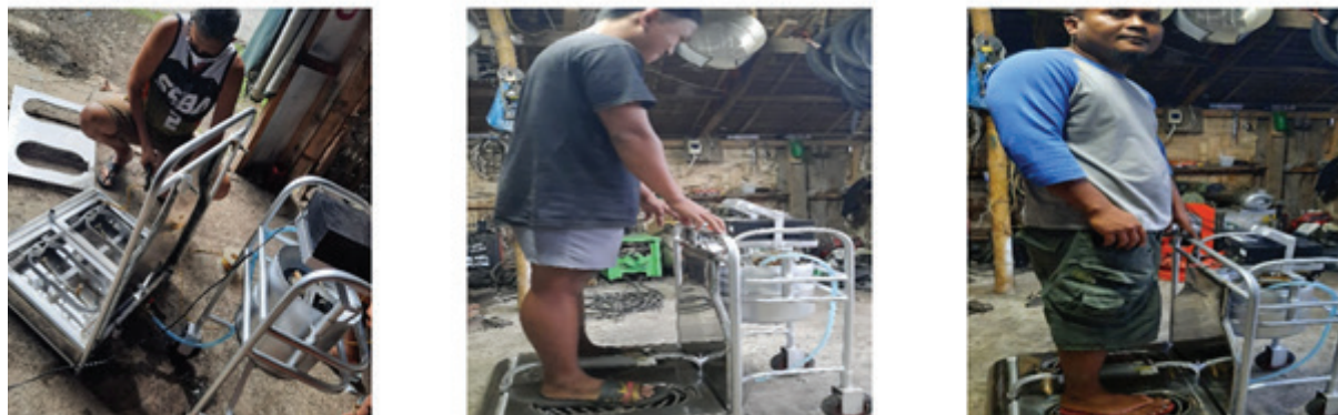
Figure 6: Wiring installation and testing of the shoe/slippers sanitizing ramp.

minute (LPM). According to WHO health findings, this mixture can already kill 99.9% of bacteria. Any type of disinfection liquid, including neutral sanitizing liquid in accordance with WHO criteria or as allowed by national regulatory bodies, may also be used, depending on its efficacy and accessibility. Two push buttons on the top of the spray head, which are shown in a schematic flow in Figure 6, are used to activate and start the disinfectant spray. It is simple to use or replace a collection basin that is situated below the sanitizing ramp for cleaning needs. The cost analysis was done by comparing the specifications of the sanitizing ramp with the two models