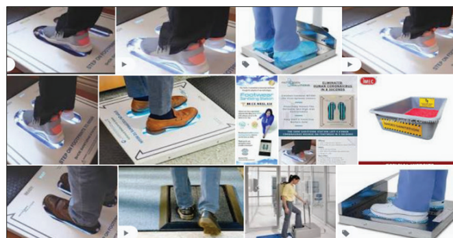
Figure 2: Images of commercially available shoe sanitizing stations. ( https://rb.gy/jiy0g )

Also, there are commercially available sanitizing ramps that use ultra-violet rays as means of sanitizing shoes is shown in Figure 2.