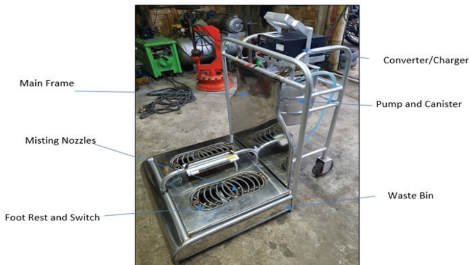
Figure 3: The shoe/slippers sanitizing ramp.