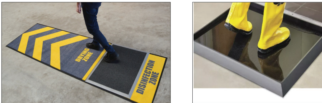
Figure 1: Sanitizing mat/trays used for shoe/slippers.

even if the sole has deep flex grooves or high heels. Rashida, et al. (2017) found a significant bioburden of microorganisms on shoe soles. Studies have shown that either direct or indirect transmission paths might result in the colonization of patients with microbiological infections from shoe soles. Shoes and slippers are one of the primary points of contact in public spaces, according to Eskie's research from 2020. People thus face the risk of introducing germs like viruses and other harmful ones into their houses. E. Allen Al, 2010, said in their study that employing disposable shoe coverings or disinfectant mats may help lower the bacterial burden on the flooring of rodent holding rooms. Also, a research team discovered virus on floors, computer mice, trash cans, sickbed handrails and doorknobs. What is most revealing in their study is that half of the medical teams' shoes tested positive for the virus. So, using a sanitizing mat (figure 1.) to disinfect shoes at the door help further prevent the spread of COVID-19.