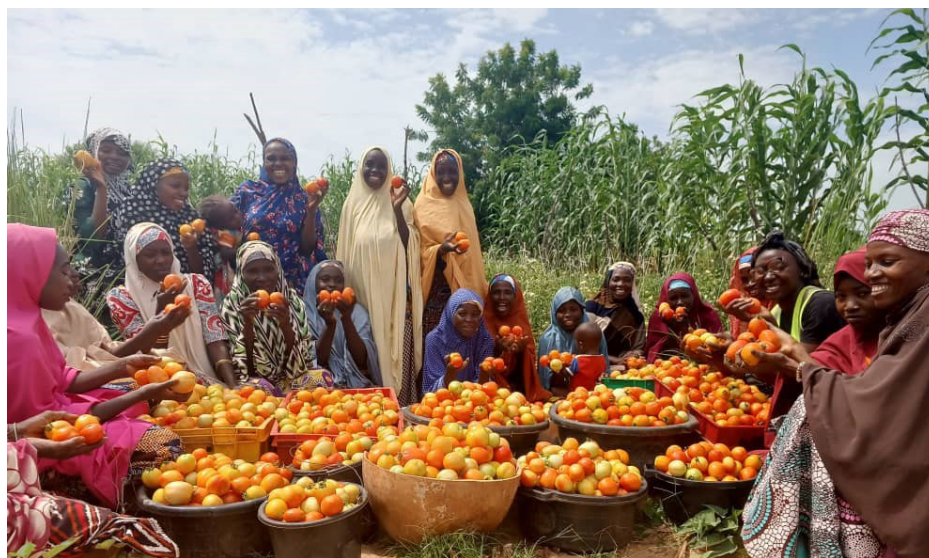
Figure 3: Nigeria Field Survey on Tomato Production

Research indicates that the most prevalent form of food loss and waste in Nigeria pertains to major vegetables. Market areas often exhibit piles of vegetable waste nearby or within nearby dumpsites. Storage challenges, pest and disease infestations, delays in transportation to sales points, and fluctuating temperatures, depending on weather conditions, are among the key factors contributing to this vegetable waste. A value chain study conducted by the Central Bureau of Investigation (CBI) in 2021 highlighted tomatoes, onions, and chili peppers as the primary sources of food waste among vegetables. The table below illustrates the production of these vegetables in Nigeria from 2015 to 2019, measured in tonnes, according to data from the Food and Agriculture Organization (FAO).