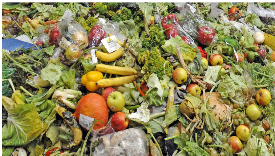
Figure 1: Vegetable Waste in Nigeria

indicates that 690 million people experienced hunger in 2019, a figure expected to rise significantly during and after the COVID-19 pandemic, with an astonishing 3 billion people unable to afford a nutritious diet (FAO, 2020). Given the escalating global population, food waste and food security have become focal points for both researchers and policymakers across developed and developing nations (Chalak et al. , 2019). Farmers engage in agriculture for various reasons, including catering to the needs of the rapidly expanding global population. Food is a basic human necessity crucial for survival, yet our consumption habits, disposal practices, and wastage profoundly impact both us and the environment we inhabit. According to national estimates, Nigeria generates approximately 32 million tonnes of waste annually, encompassing all stages of vegetable production (Lantz, 2021). Research indicates that the most prevalent form of food waste and loss occurs in perishable goods such as vegetables.