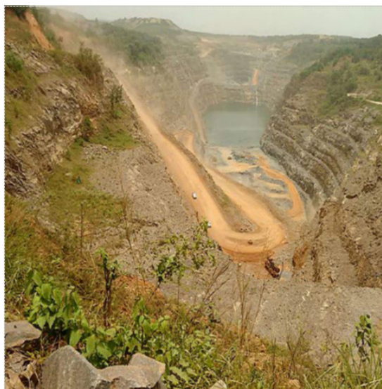
Goldfield Damang mine

Figure 2 shows the extent of pollution of the Ankobra River by mining activities. This has harmed aquatic life and contaminated water sources, posing a human health risk. For example, the respondents said that mining companies warned community members not to use the water for drinking and bathing.