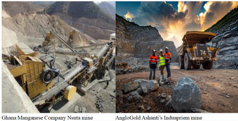
Ghana Manganese Company Nsuta mine