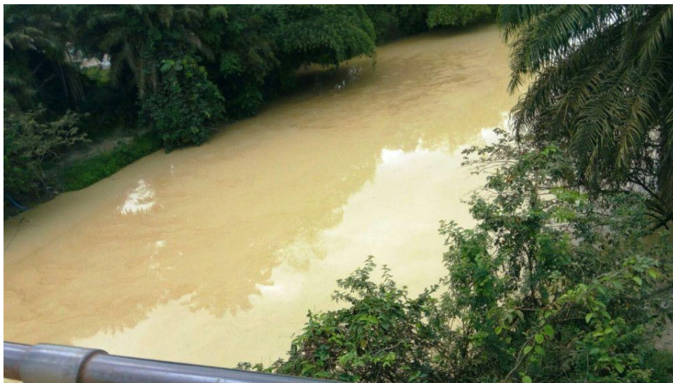
Figure 2: Mining polluted Ankobra River