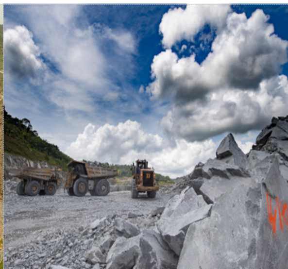
Goldfield Tarkwa mine