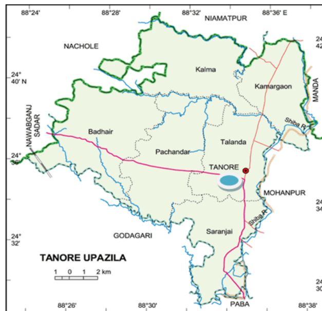
Figure 1: Location of study area indicated with blue marks (●) at Tanore upazila of Rajshahi district, Bangladesh.

The present study was conducted in Tanore upazila under Rajshahi District for a period of six month from July 2019 to December 2019. (Fig.01). 12 experimental ponds with an average area of 0.78 ha and average depth of 3m were selected for this study.